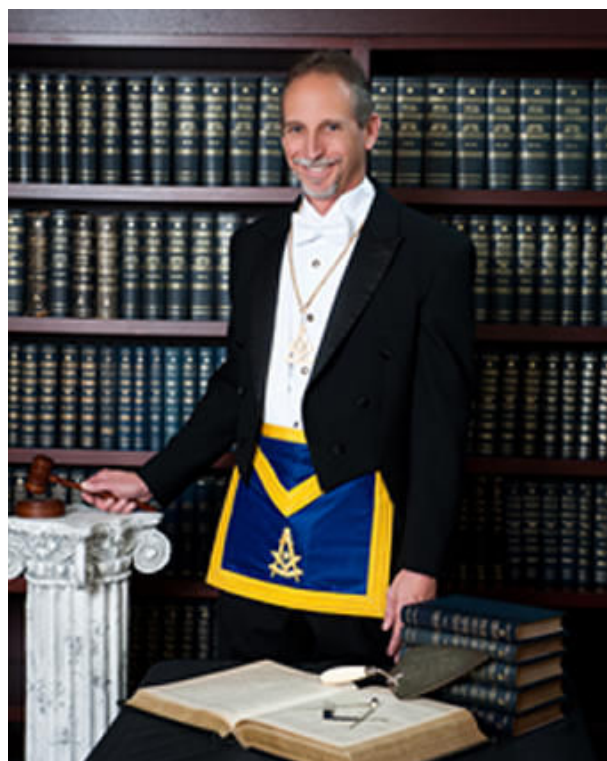
Speaker for June

Views from Ventura Valley, the Ventura County Scottish Rite News, Volume XXXVII, Issue number 4. Published 5 to 6 times a year by the Ventura County Scottish Rite Bodies, 487 Appletree Ave, Camarillo, CA 93012-5148. This publication is distributed free of charge to all members. For further information call 805-415-3776.