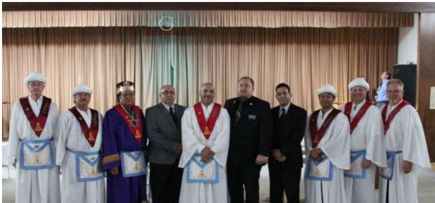
14 th Degree Cast with Candidates