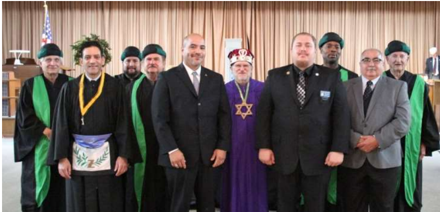
4 th Degree Cast with Candidates