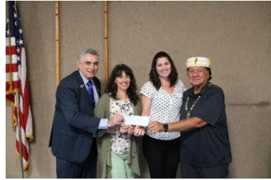
Summer Picnic. A big Thank You to everyone who worked to make that event a success.