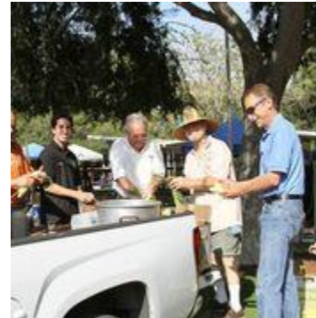
(Above left) The corn is shucked.